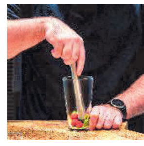
MUDDLE TYPE: MOJITO

Rinse out blender cup immediately and return to blender base