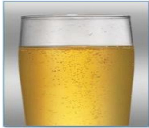
"Flat" Beer Film or grease attack the foam, reducing the appeal