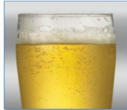
"Off" Taste Beer Odors from sanitizers, bar towels and improper storage affects quality

WATER TEST - Submerge the glass in water, when you lift it out the water should sheet off of the glass. If droplets cling that is a sign of film present.