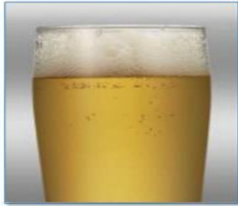
"False" Beer Rapid loss of foam requiring refills to "top off"